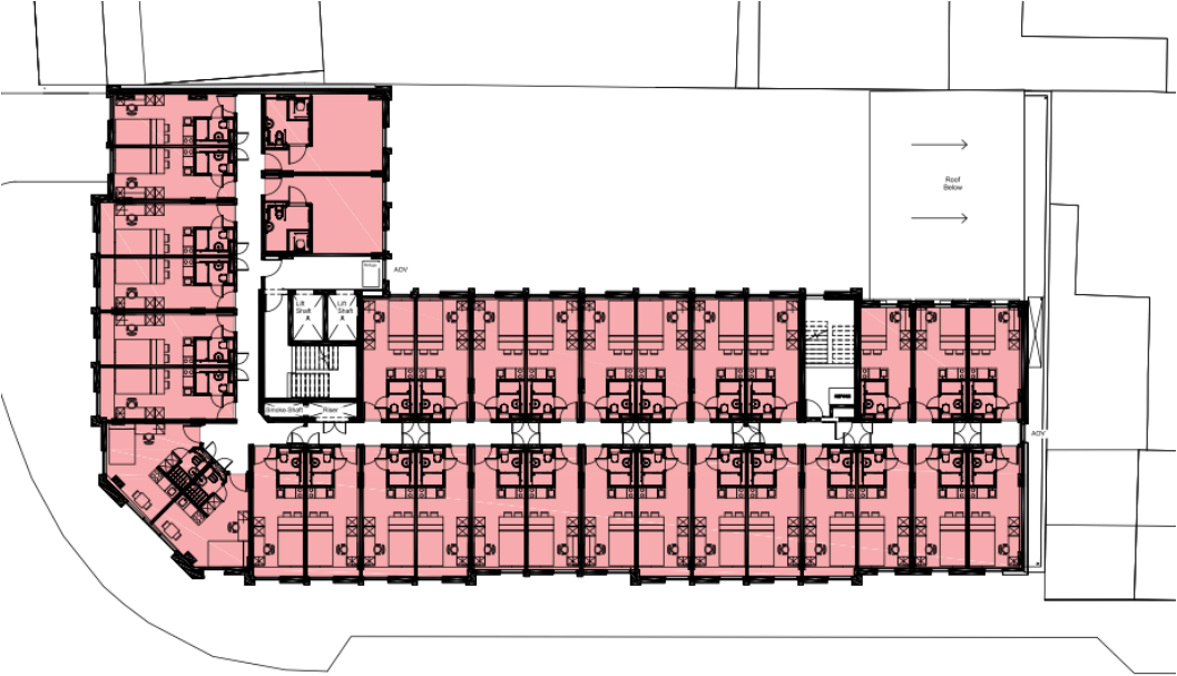
5TH FLOOR PLAN (38no. STUDIOS)